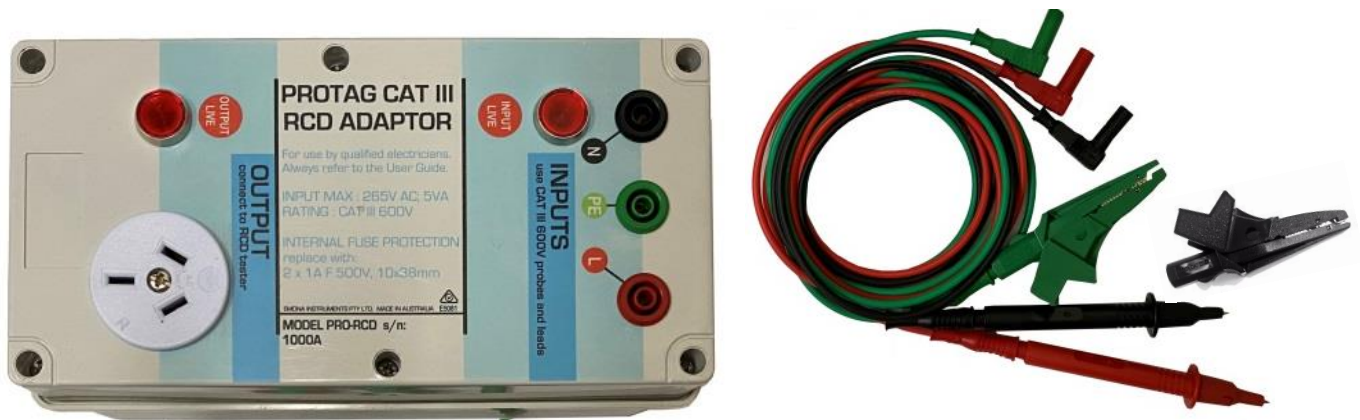
PROTAG CAT III RCD ADAPTOR – model PRO-RCD and 600V CAT III Test Lead Set