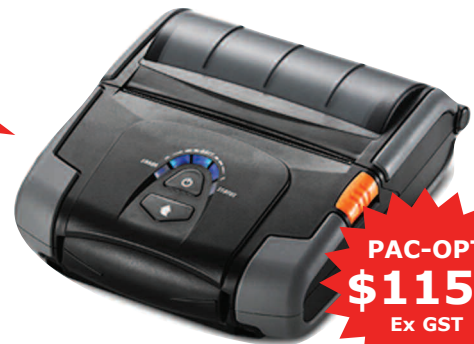
Test Tags PAC-OPT AS/NZS3760 Test Tag Printer